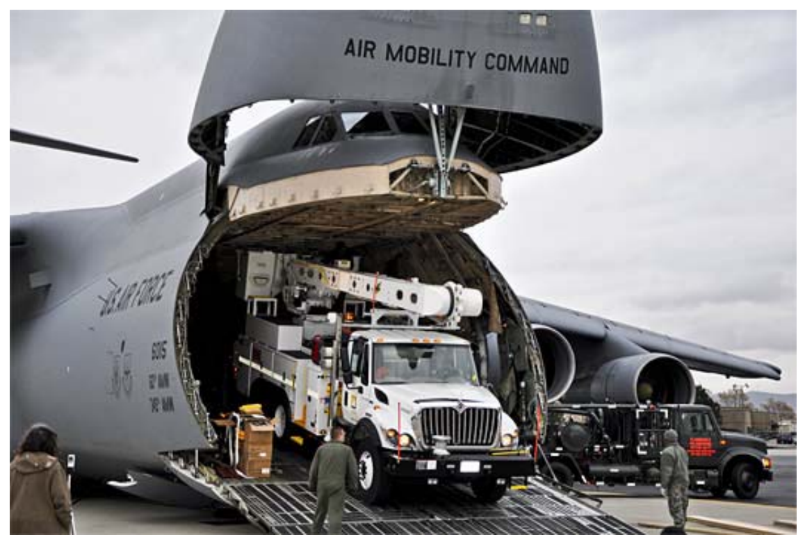
Air Force crews offload Southern California Edison power repair equipment from a C-5 Galaxy on Stewart Air National Guard Base in Newburgh, N.Y., Nov. 1, 2012

USNORTHCOM also leveraged relationships with United States Transportation Command and interagency partners to execute the strategic and ground movements of DOD assets and private/commercial power utility company trucks and personnel. In total, USNORTHCOM directed the movement of 253 sorties, hauling 4,204 short tons and 1,128 passengers. These numbers included the movement of 260 power restoration vehicles and 429 personnel from western states to New York and New Jersey.