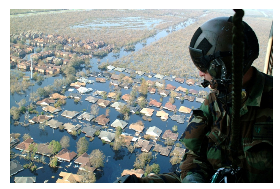
Tech. Sgt. Keith Berry, a pararescueman with the 304th Rescue Squadron from Portland, Oregon, looks down on flooded streets searching for survivors over New Orleans. He is part of an Air Force Reserve team credited with saving more than 1,040 people in the aftermath of Hurricane Katrina.

Katrina then crossed the Gulf of Mexico, intensifying to a Category 5 hurricane and headed for the gulf coast locales of Alabama, Mississippi, and Louisiana. As Katrina approached the coast it weakened and on August 29 Katrina made landfall again, this time as a Category 3 hurricane, inundating New Orleans as levees protecting the city failed, and inflicting wide spread damage across the region. In total the effects of the storm were staggering, causing roughly $80 billion damage and killing more than 1,800.