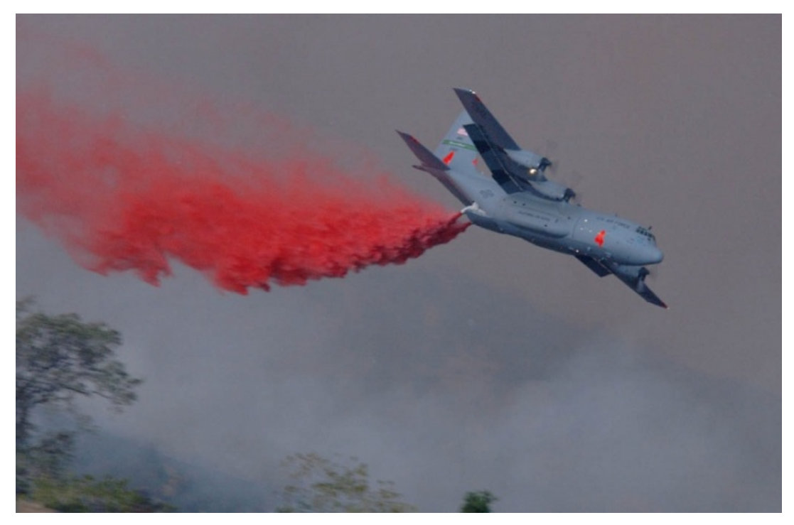
A Modular Airborne Fire Fighting System (MAFFS) equipped C-130 drops retardant on a wildland fire

stood up, when Hurricane Lilli struck the gulf coast with 100 mile an hour winds causing extensive damage. In 2003 USNORTHCOM contributed to the Space Shuttle Colombia disaster response in February, provided airborne fire fighting capability during the intense wildfire season in the western United States occurring through the summer and fall, and provided disaster relief in the aftermath of Hurricane Isabel, which struck the eastern seaboard in September.