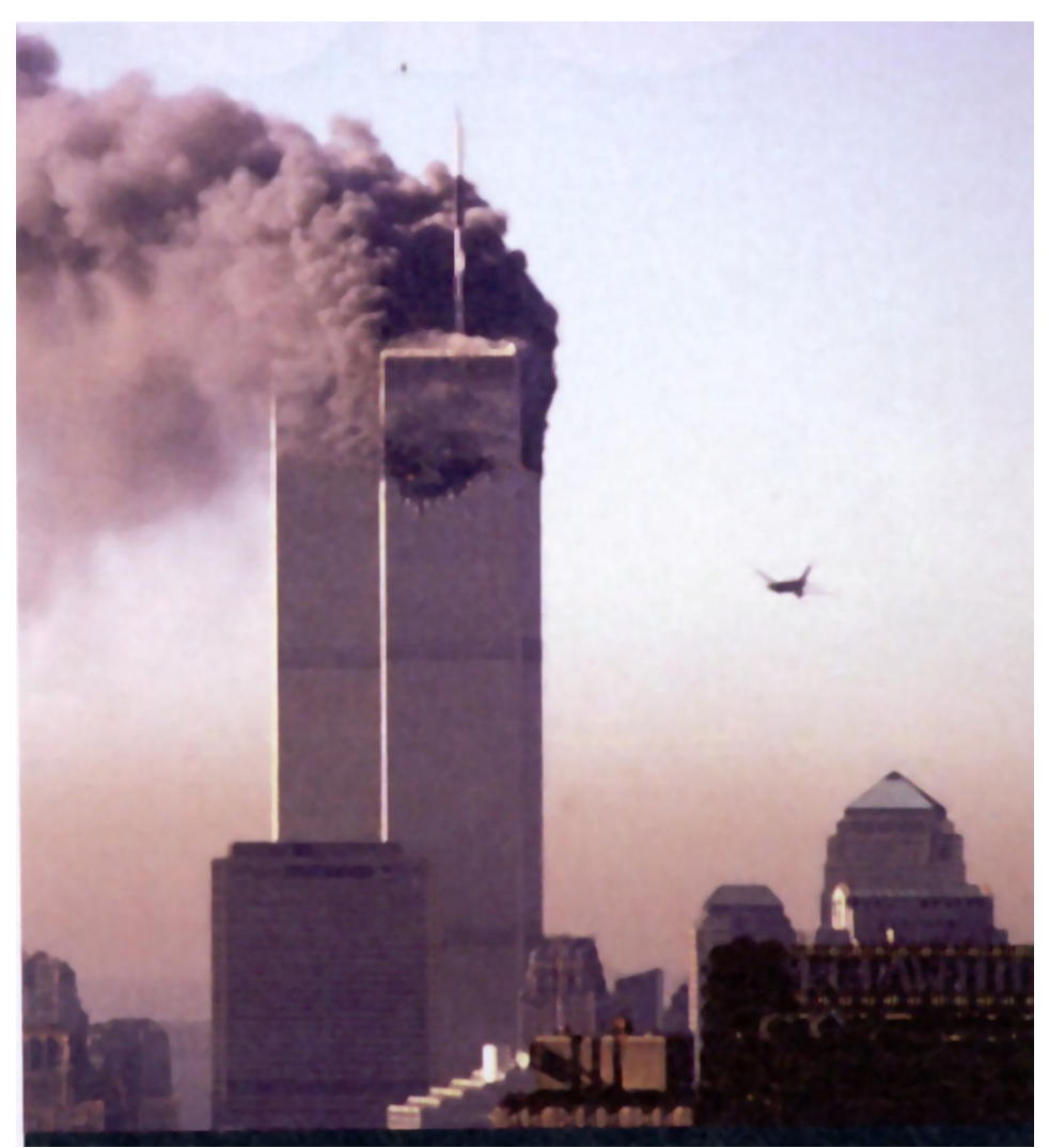
The horrific attacks of September 11, 2001 led to the creation of U.S. Northern Command

Prompted by the September 11, 2001 (9/11) terrorist attacks on American soil, U.S. Northern Command's mission is to deter, prevent and defeat threats and aggression aimed at the United States, its territories, and interests. To this end personnel from the Army, Navy, Air Force, Marine Corps and Coast Guard are assigned to coordinate the protection of North America from external threats, drawing on the full capabilities of all U.S. military services, including the National Guard and Coast Guard, as necessary. Additionally, the command is charged with providing defense support for civil authorities when approved by the President or Secretary of Defense. U.S. Northern Command (USNORTHCOM) also provides military resources and support to federal, state and local authorities.