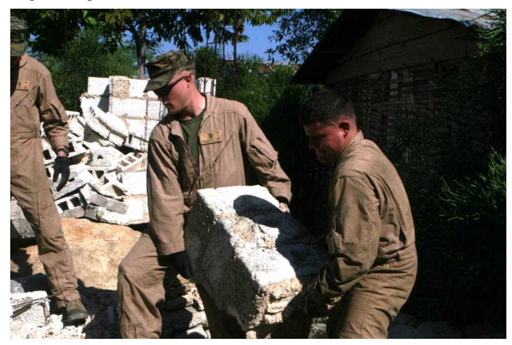
U. S. Marines clearing rubble in the aftermath of the January 2010 Haiti Earthquake

drawing to a close, a string of three hurricanes—Gustav, Hanna, and Ike—struck the United States during a thirteen-day span in August and September. Gustav and Ike made landfall along the shores of the Gulf of Mexico, in Louisiana and Texas, respectively. Sandwiched between the two gulf storms, Hanna struck the North Carolina coast. These three near simultaneous events in two different regions provided quite a challenge for USNORTHCOM but the men and women of the command proved up to the task.