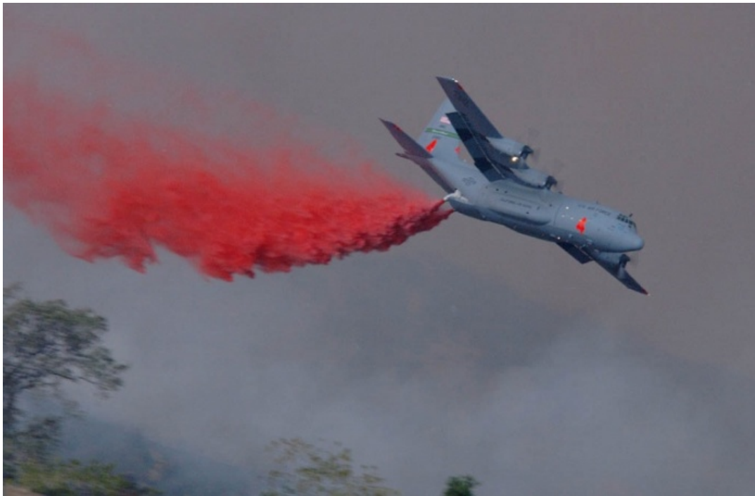
A Modular Airborne Fire Fighting System (MAFFS) equipped C-130 drops retardant on a wildland fire

stood up, when Hurricane Lilli struck the gulf coast with 100 mile an hour winds causing extensive damage. In 2003 USNORTHCOM contributed to the Space Shuttle Columbia disaster response in February, provided airborne fire fighting capability during the intense wildfire season in the western United States occurring through the summer and fall, and provided disaster relief in the aftermath of Hurricane Isabel, which struck the eastern seaboard in September.