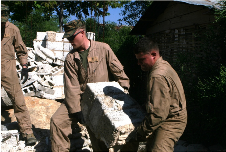
U. S. Marines clearing rubble in the aftermath of the January 2010 Haiti Earthquake

drawing to a close, a string of three hurricanes—Gustav, Hanna, and Ike—struck the United States during a thirteen-day span in August and September. Gustav and Ike made landfall along the shores of the Gulf of Mexico, in Louisiana and Texas, respectively. Sandwiched between the two gulf storms, Hanna struck the North Carolina coast. These three near simultaneous events in two different regions provided quite a challenge for USNORTHCOM but the men and women of the command proved up to the task.