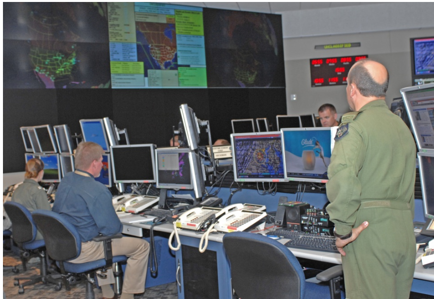
The NORAD and USNORTHCOM Command Center, May 2008.