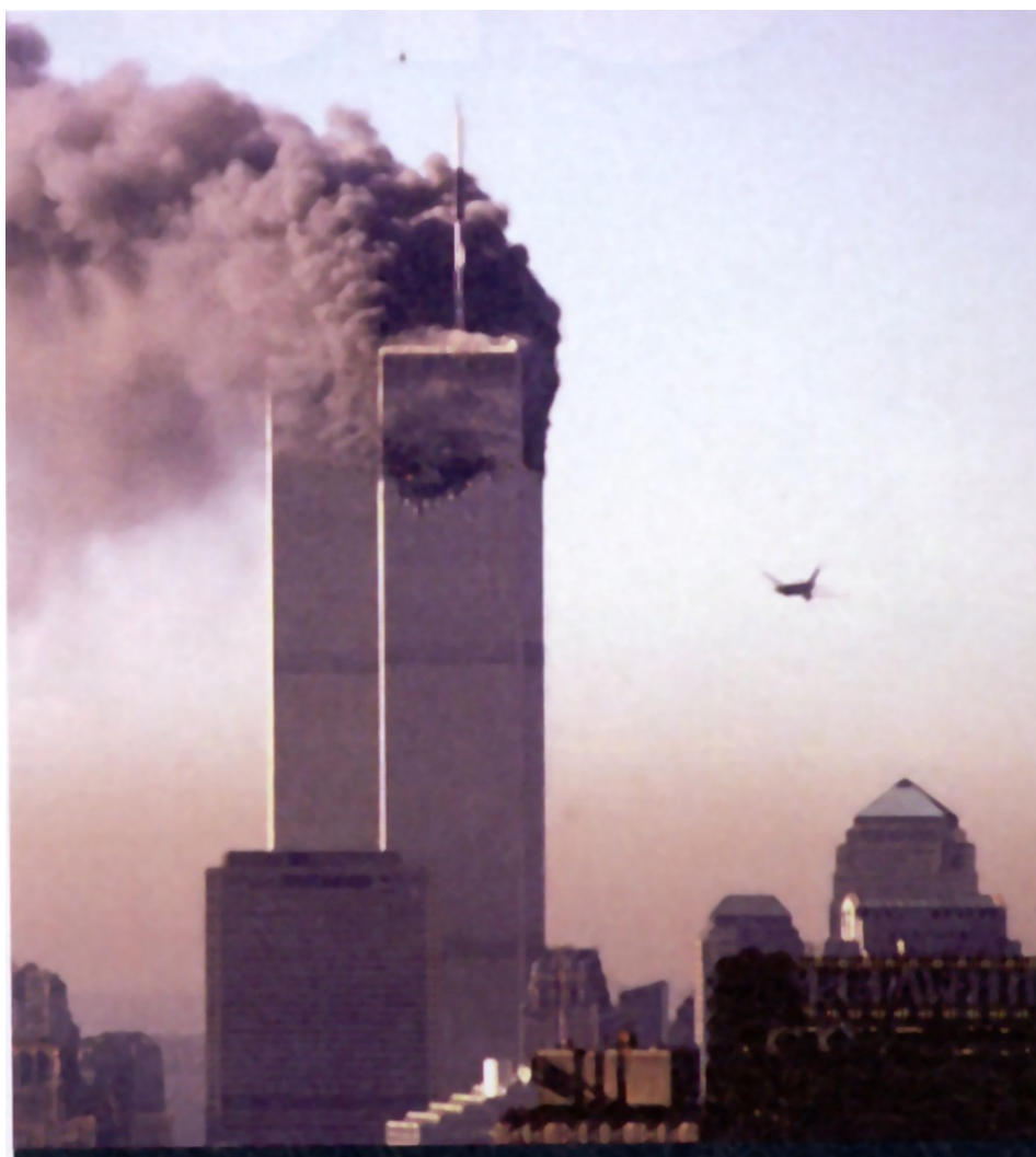
The horrific attacks of September 11, 2001 led to the creation of U.S. Northern Command

Prompted by the September 11, 2001 (9/11) terrorist attacks on American soil, U.S. Northern Command's mission is to deter, prevent and defeat threats and aggression aimed at the United States, its territories, and interests. To this end personnel from the Army, Navy, Air Force, Marine Corps and Coast Guard are assigned to coordinate the protection of North America from external threats, drawing on the full capabilities of all U.S. military services, including the National Guard and Coast Guard, as necessary. Additionally, the command is charged with providing defense support for civil authorities when approved by the President or Secretary of Defense. U.S. Northern Command (USNORTHCOM) also provides military resources and support to federal, state and local authorities.