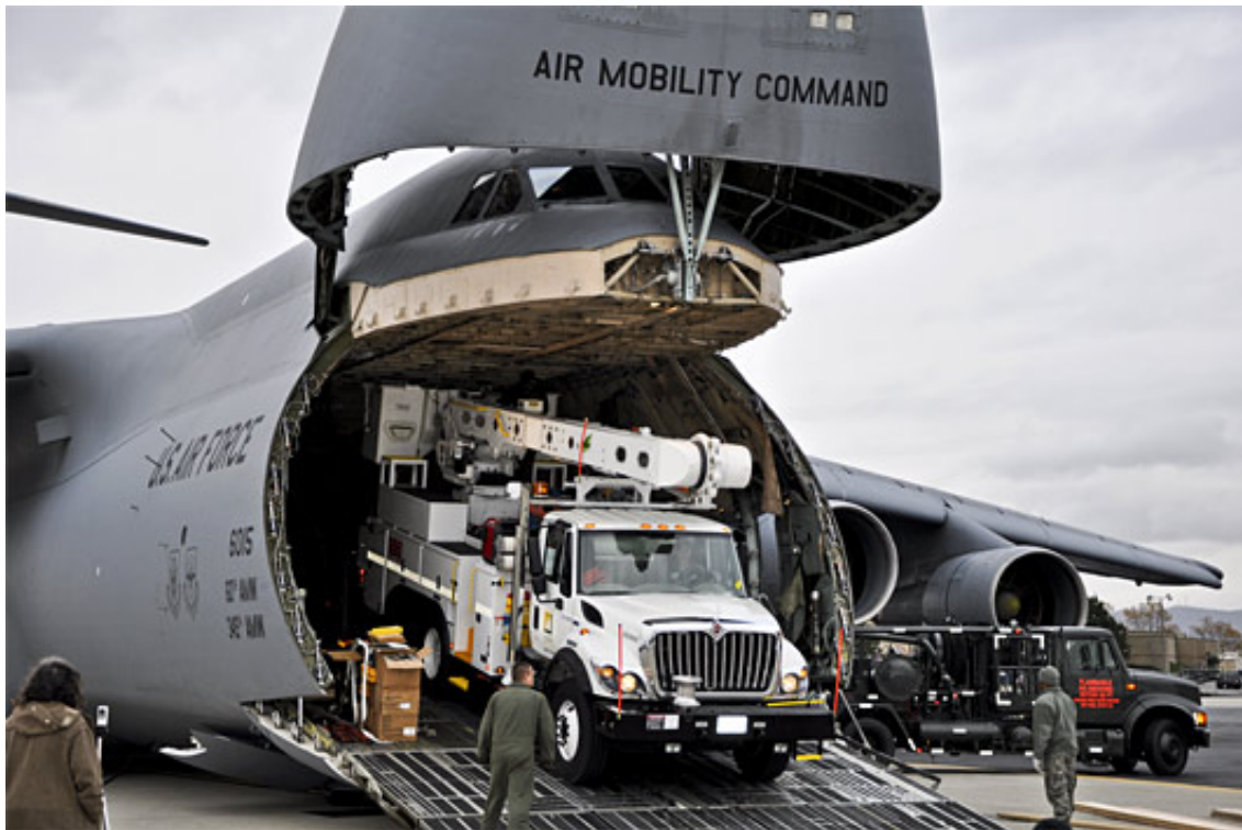
Air Force crews offload Southern California Edison power repair equipment from a C-5 Galaxy on Stewart Air National Guard Base in Newburgh, N.Y., Nov. 1, 2012

USNORTHCOM also leveraged relationships with United States Transportation Command and interagency partners to execute the strategic and ground movements of DOD assets and private/commercial power utility company trucks and personnel. In total, USNORTHCOM directed the movement of 253 sorties, hauling 4,204 short tons and 1,128 passengers. These numbers included the movement of 260 power restoration vehicles and 429 personnel from western states to New York and New Jersey.