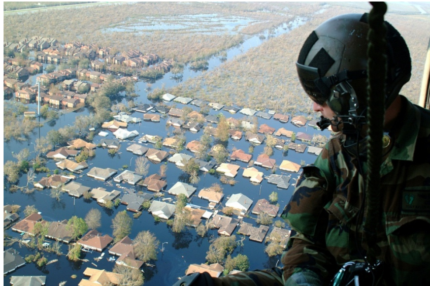
Tech. Sgt. Keith Berry, a pararescueman with the 304th Rescue Squadron from Portland, Oregon, looks down on flooded streets searching for survivors over New Orleans. He is part of an Air Force Reserve team credited with saving more than 1,040 people in the aftermath of Hurricane Katrina. .

Katrina then crossed the Gulf of Mexico, intensifying to a Category 5 hurricane and headed for the gulf coast locales of Alabama, Mississippi, and Louisiana. As Katrina approached the coast it weakened and on August 29 Katrina made landfall again, this time as a Category 3 hurricane, inundating New Orleans as levees protecting the city failed, and inflicting wide spread damage across the region. In total the effects of the storm were staggering, causing roughly $80 billion damage and killing more than 1,800.